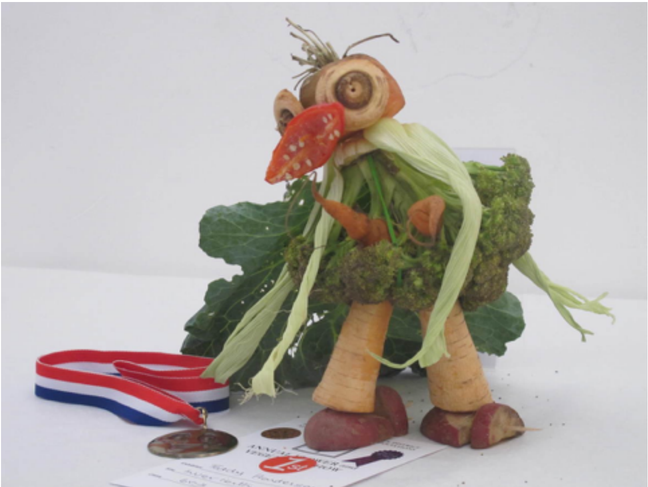
The 2017 All-Conquering Veggie Monster

The 2017 Show was a great success, going by the number of participants, the standard of exhibits and the large number of visitors. This year there were 66 exhibitors and 354 exhibits - more than double the figures for 2016.