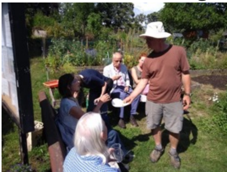
"One spud or two, Madam?"