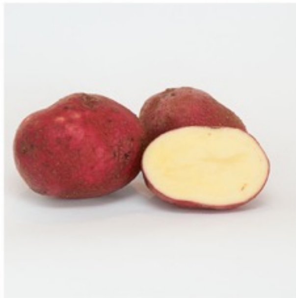
Red Duke of York

How the scheme works: Each site puts in an order comprising all requests and payments from members. Participating sites require a volunteer order co-ordinator. If you don't know who this is ask your site rep or a committee member. (If you are on a site with no representation, why not step forward to be the change you'd like to see?) The price contains a rebate of 50p per bag of potatoes and 25p per bag of onions or shallots which goes back to site funds, so this is a way of saving yourself some money and helping your site for the benefit of all. Some sites forego the rebate and further reduce the cost to members. There might be one or two varieties that will be unavailable when the order goes in so please mention what substitution you'd like.