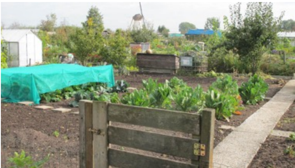
Dutch allotment complete with distant 1740s windmill.