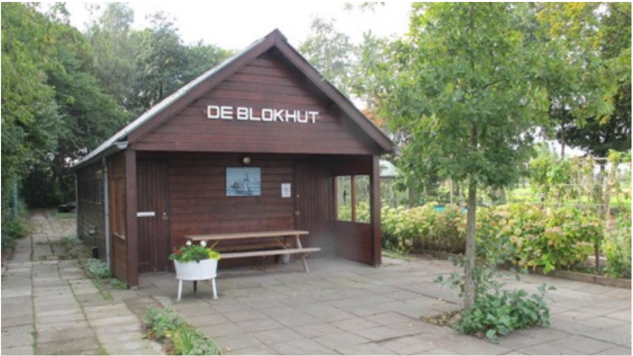
The Log Cabin.

It seems that Dutch allotments, or volkstuinten , are operated autonomously in line with local authority regulations, some of which allow overnight stays in the fancy accommodation seen in cities. The site we visited had a handsome communal shed, De Blokhut. As this translates to "log cabin" there can be no lazy accusations of sexism. Dutch allotments date from the 17th century and there are now nearly a quarter of a million plots. Given the population is 17m then they are way ahead of Scotland in terms of provision. The summer climate is warmer and the soil is famously fertile. We could do worse than emulate these folk.